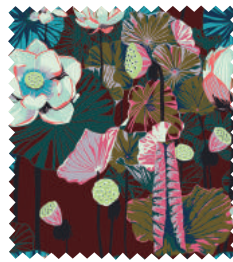
PWAM012.GARNE Lotus - Garnet