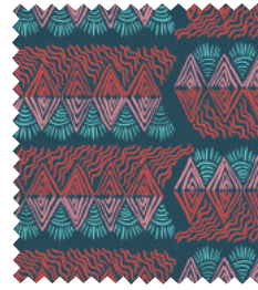
PWAM014.FIREX Mountain Streams - Fire