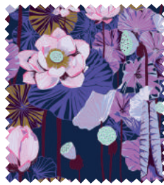
PWAM012.PRUSS Lotus - Prussian