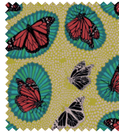
PWAM013.GOLDE Monarch - Golden