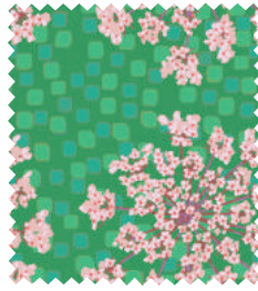
PWAM015.KIWIX Queen Anne - Kiwi