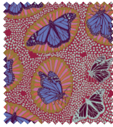
PWAM013.FRUIT Monarch - Fruit