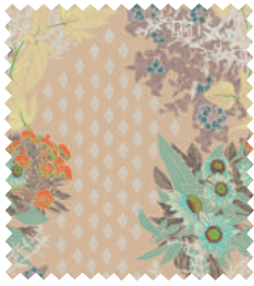
PWAM011.ANTIQ Front Walk - Antique