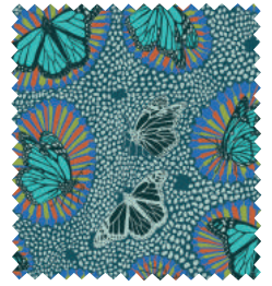
PWAM013.CIRCU Monarch - Circus