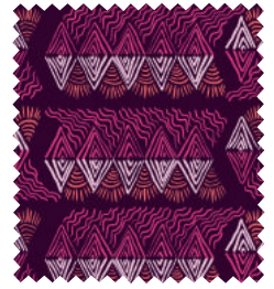
PWAM014.CHERR Mountain Streams - Cherry