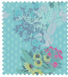
PWAM011.SKYXX Front Walk - Sky