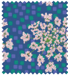
PWAM015.LAGOO Queen Anne - Lagoon