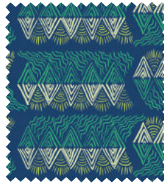
PWAM014.VERDA Mountain Streams - Verdant