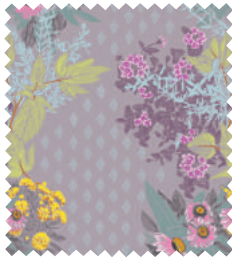
PWAM011.HEATH Front Walk - Heather