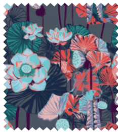
PWAM012.MIDNI Lotus - Midnight